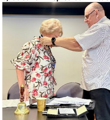
Doin' the business!