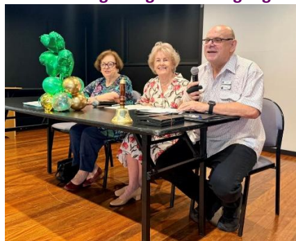
Last parade for the year before the AGM!