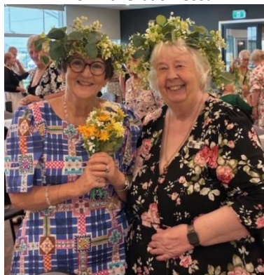
Queens of all the Faeries!