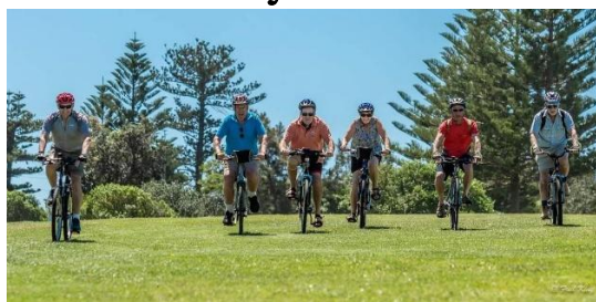
Wobbling along in Wollongong!